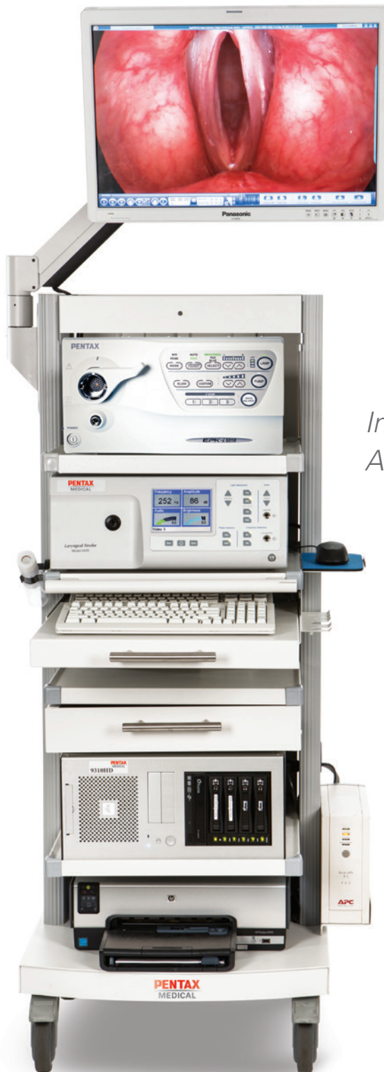
Image Quality, Clinically Relevant Advancements, and Workflow Efficiency